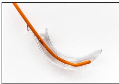
Figure 2 The CoPilot VL® disposable sheath with bougie

Data recorded for each subject included age, gender, American Society of Anesthesiologists (ASA) classification reference, height, weight, thyromental distance, Mallampati score, mouth opening, cervical spine range of motion and history of any difficult intubation. 8-10