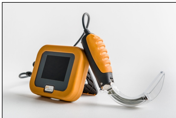
Figure 1 The CoPilot VL ® video laryngoscope

Since video laryngoscopy was introduced over 10 years ago, a multitude of studies have been published evaluating effectiveness of the technique. 1-5 Many studies have demonstrated improved laryngeal views with video laryngoscopes, but the question remains whether improved laryngeal views translates to improved intubation success. 6,7 Currently available devices either limit the user to intubating with a stylet or using a device with an endotracheal tube channel.